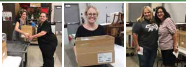
Women receiving food through the 5th week pantry