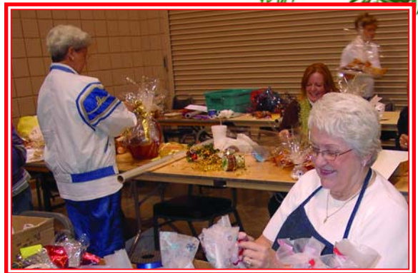
The Bake Sale looked fabulous thanks to our many decorators.