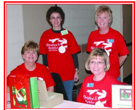
The Soroptomist Club worked the admissions tables all weekend!