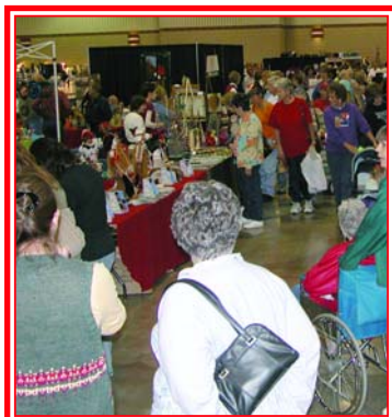
Vendors enjoyed the highest attendance ever at a Christmas in October event.