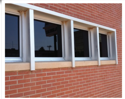
A special "Thank You" to Royal Glass of Amarillo for providing beautiful windows for the new building!