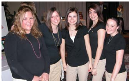
These lovely young ladies are members of the Paramount Christian Church youth group who volunteered at HopeFest