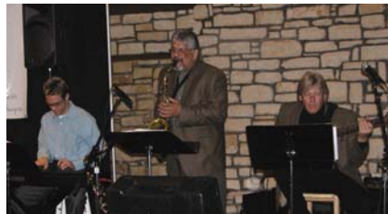
The Martini's Jazz Band provided delightful entertainment