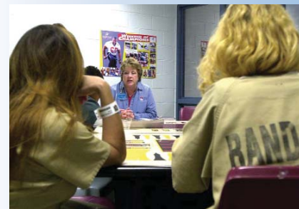
Randall County Jail