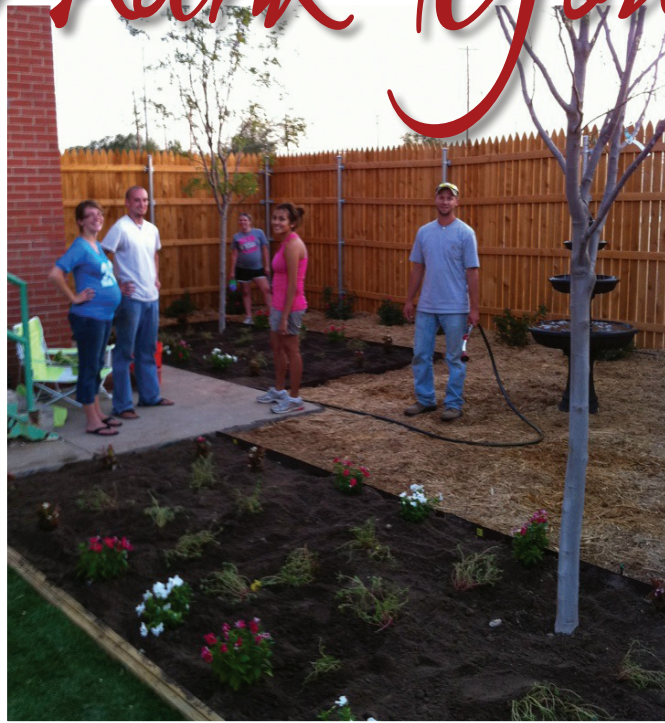
Hillside Life Group provides the landscaping for the finished PPTH courtyard.

Thank you to everyone who provided labor and items for the garage sale.