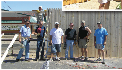
Men from Trinity Fellowship Church provide a fence for PPTH.