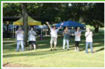
Volunteers at the Race

to all of the participants, volunteers, and sponsors of the 3rd annual Race 4 Recovery! With everyone's combined efforts we were able to raise over $16,000 for Patsy's Place this year! We fell a little short of our goal of $20,000. Please consider giving an after event donation for the Race 4 Recovery to help us get closer to our goal. Your donation will directly benefit Patsy's Place Transitional Home.